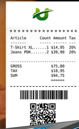
80mm Thermal Printer